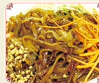
Pad Thai Shrimp