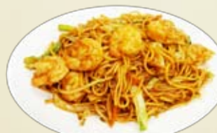
Shrimp Chow Mein