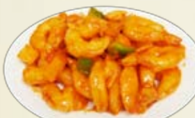
Sweet & Sour Shrimp